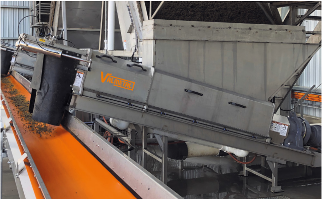
Hopper Feed Screw Press