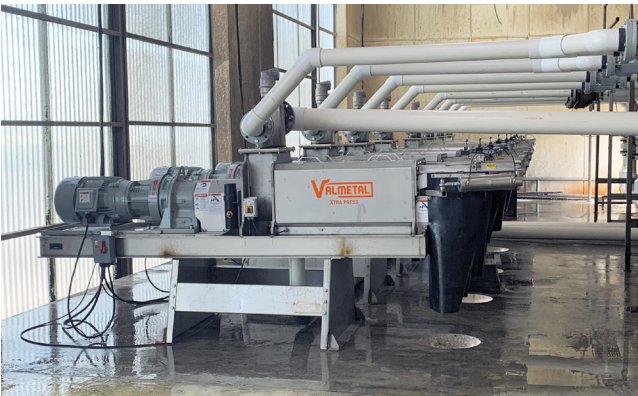
Direct Feed Screw Press