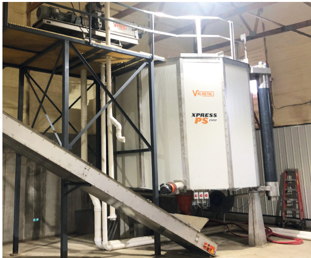
The compact system fits indoors so can be used in all climates.

The Valmetal Xpress-PS pasteurizer is a continuous-flow system, constantly producing large volumes of pasteurized bedding, completely automatically.