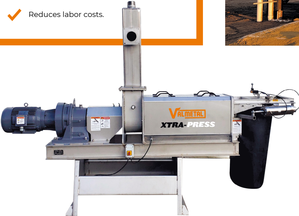
Uniform bedding quality The fully automated Xtra-Press features air-operated exit doors, providing constant pressure to ensure uniform bedding quality for your herd.